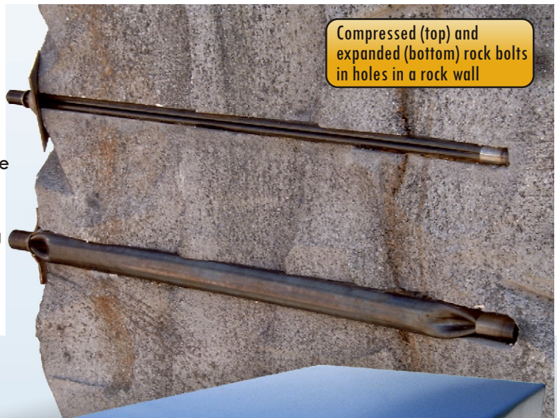
Compressed (top) and expanded (bottom) rock bolts in holes in a rock wall

The light and compact is easy to move around and bring along wherever needed. The core of the unit is a patented hydraulic high pressure pump whose construction contains no rotating parts. Along with the tough outer shell, this guarantees the unit a long service career in even the toughest environment.